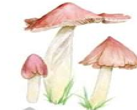
10. Pink Waxcap Porpolomopsis colypteriformis