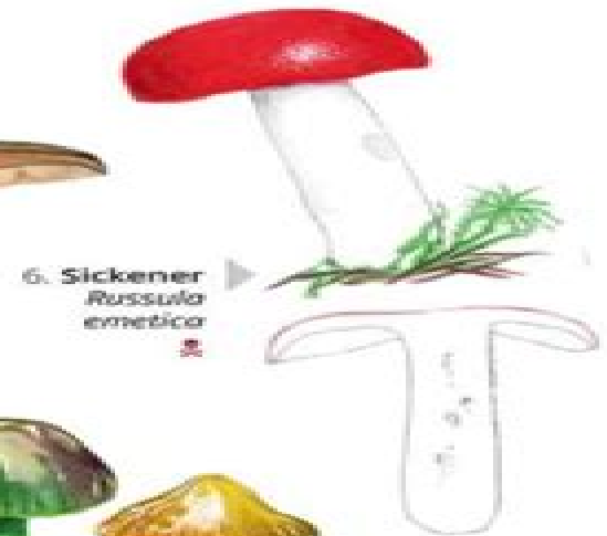
6. Sickener Russula emetica