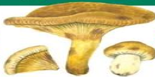
2. Brown Rollrim Paxillus involutus