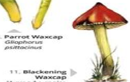
11. Blackening Waxcap Hygrocybe conica

⚠️ Poisonous/toxic illustrations not to scale