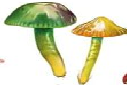
8. Parrot Waxcap Gliophorus psittacinus