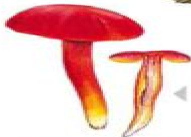
9. Scarlet Waxcap Hygrocybe coccinea