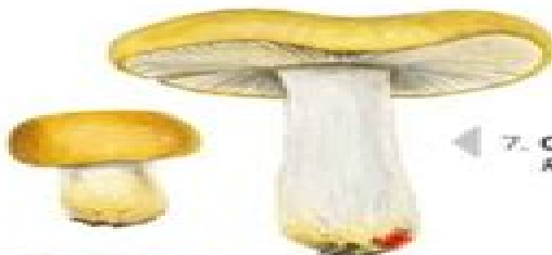
7. Ochre Brittlegill Russula ochroleuca