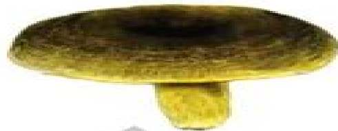
4. Ugly Milkcap Lactarius turpis