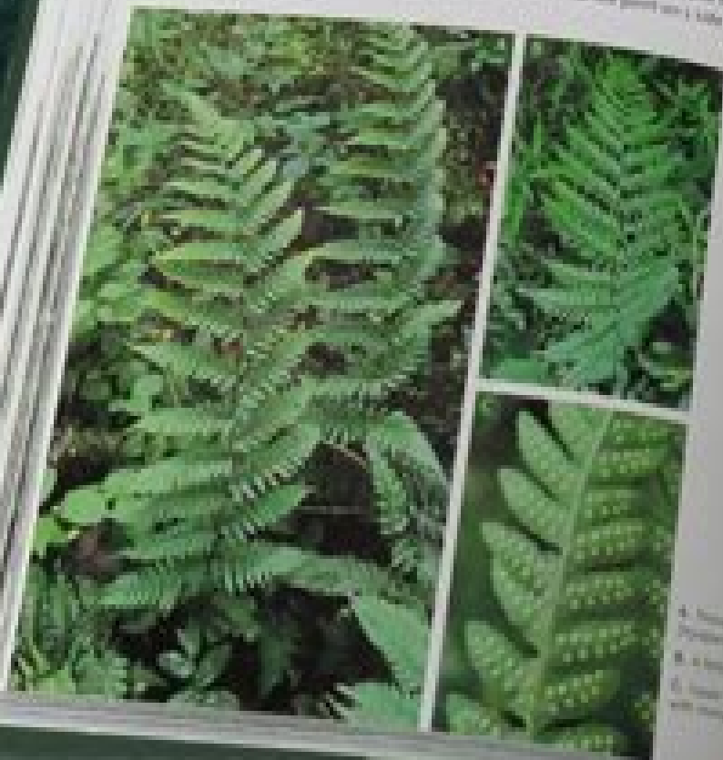
1. Review of the literature