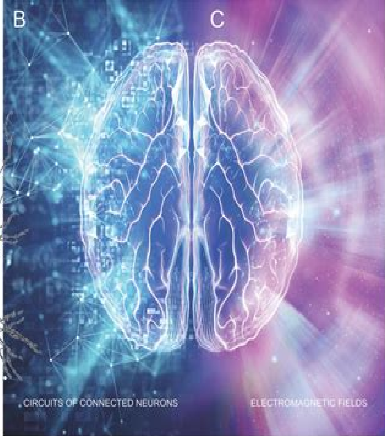
CIRCUITS OF CONNECTED NEURONS