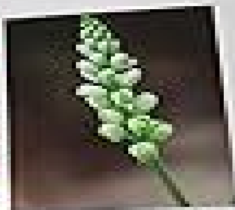
© 2004 Blackwell Publishing Ltd, Journal of Internal Medicine 255: 111–118