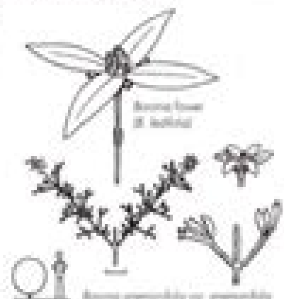
Roronia flower