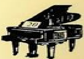
The Day Before You Came Abba