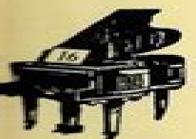
On Wings Of Song Alfred Soderstrom