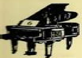
Silver Rainbow Genesis