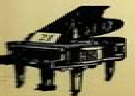
Waltz From Prince Igor Borodin