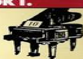
Who Do You Think You're Kidding, Mr. Hitler? 'Dad's Army'