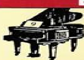
Andante K. 15mm Mozart