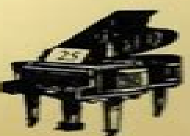
Yesterday The Beatles