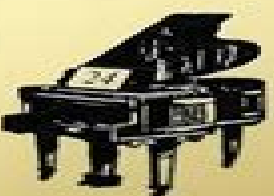
Jesu Joy Of Man's Desiring J. S. Bach