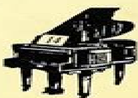
Blue Danube Johann Strauss