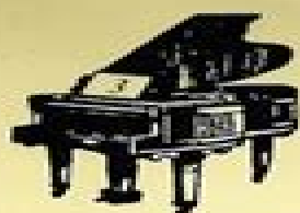
The Sound Of Silence Simon & Garfunkel