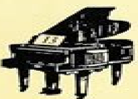
Sunrise, Sunset Fiddler On The Roof