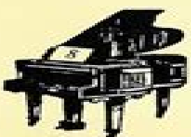
Spring Song K. 596 Mozart