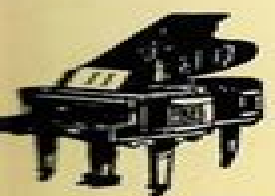
Girl From Ipanema Antonio Carlos Jobim