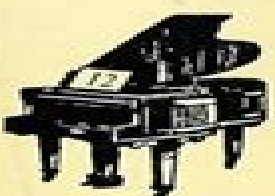
Take Me Home, Country Roads John Denver