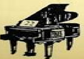
Mazurka (from 'Coppelia') Delibes