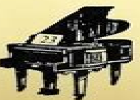
Mood Indigo Duke Ellington