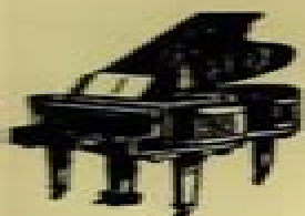
Under Paris Skies Edith Piaf