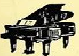
Allegro K. 3g Mozart