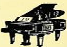
A Whiter Shade Of Pale Procol Harum