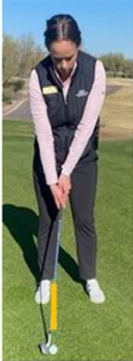
Ball Position is Back