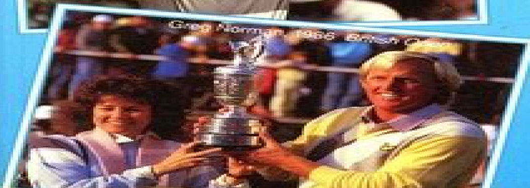
Greg Norman, 1986 British Open