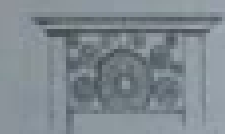
17. Окно с простым обрамлением из дерева