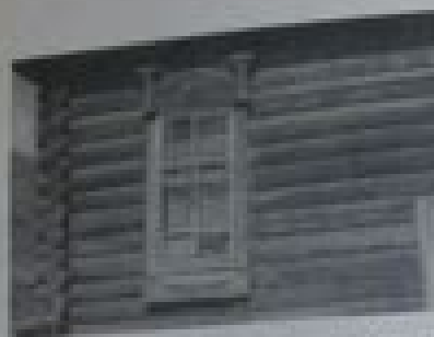
16. Окно с простым обрамлением из дерева