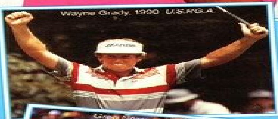
Wayne Grady, 1990 U.S. PGA