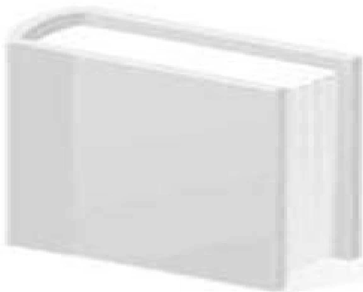
Image Not Available