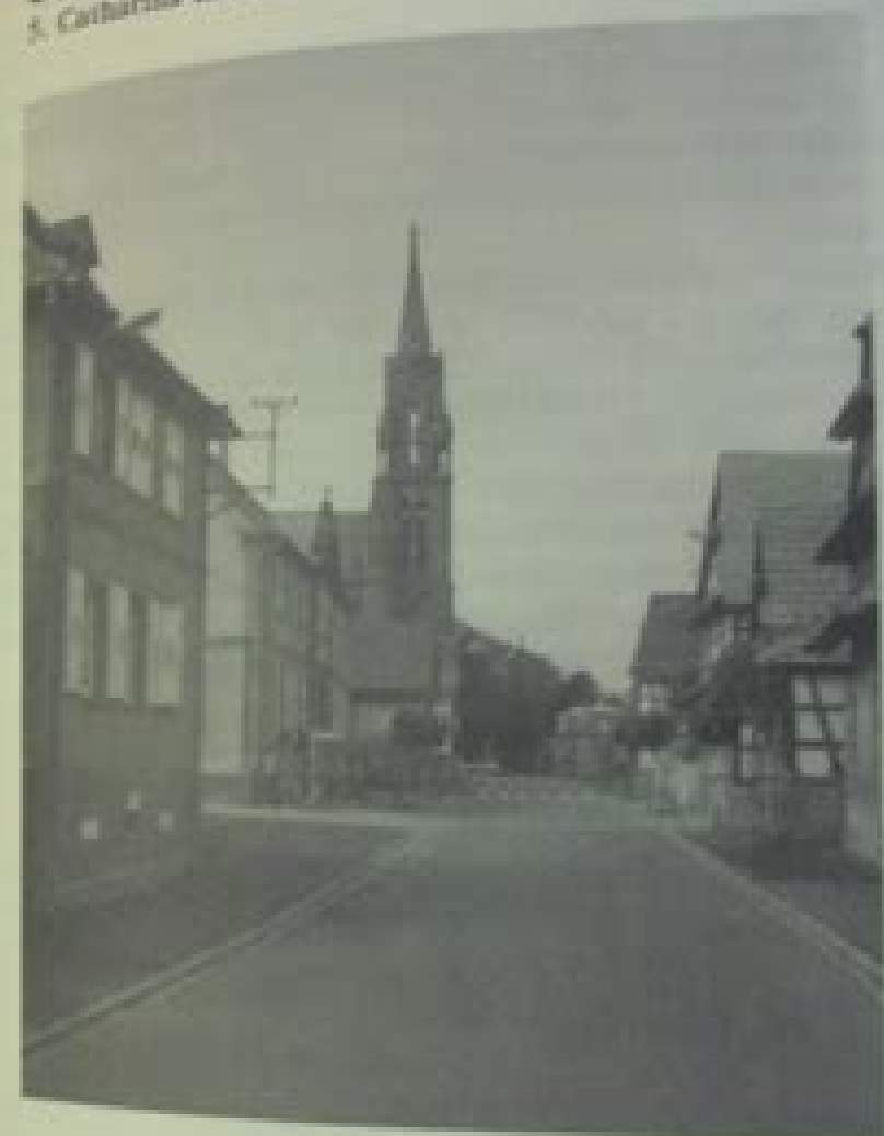
The main street in Froeschwiller.