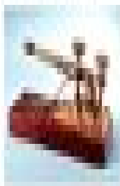
Samuel Morse invents the Telegraph