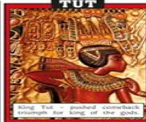
King Tut - pushed comeback triumph for king of the gods.

Tut Tut, 9, announced the togethery turn-around after high-level discussions with palace advisors. "Amun is now top god again, and his shrines and statues will be making a