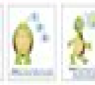
Step 2: Stop your body