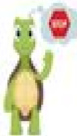
Step 2: Stop your body