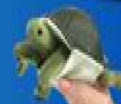
Step 2: Stop your body