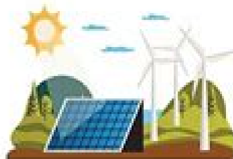
Wind Power and Solar Energy