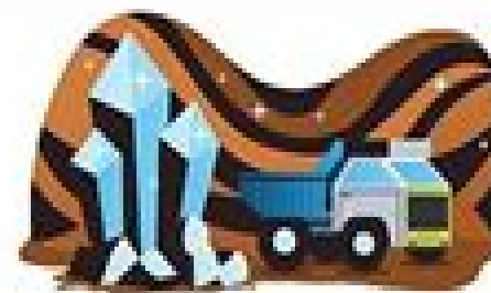
Precious Metals, Minerals, Rocks