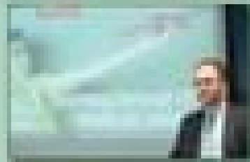
Local Business Leader

Each video is a 100-minute video featuring a local business leader, a local YEC, and a local YEC. The series is available in 100 different languages and is available in 100 different countries.