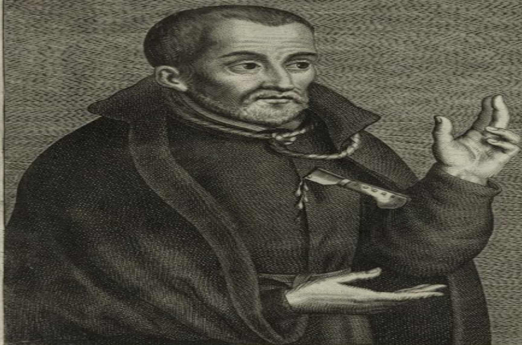
P EDMONDUS CAMPIANUS vande Societeyt IESV. ghehanghen ende ghevierendeelt voor het gheloof binnen Londen.