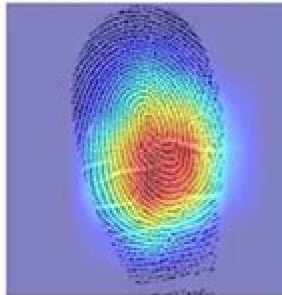
Intra-Person Similarity (Distance = 0.666)