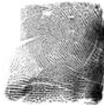
Person 00002593: Right Middle