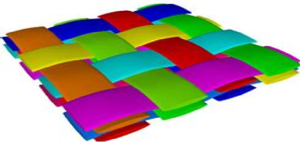
(a) Plain-woven laminate