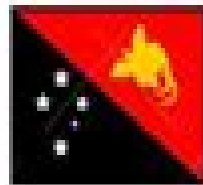
Papua New Guinea