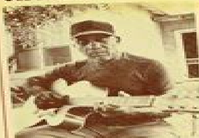
Key of G.