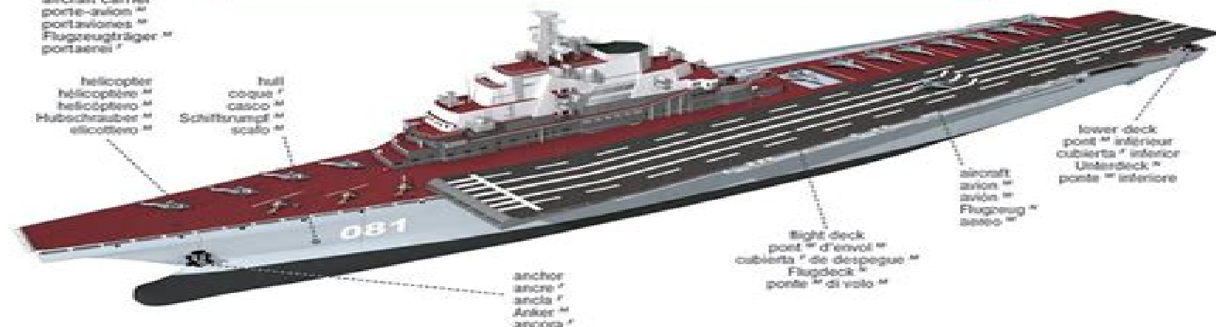
lower deck pont " inférieur cubierta " inferior Unterdeck " " ponte " inferiore " "