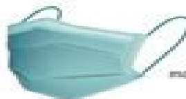
surgical mask masque " chirurgical mascarilla " de operaciones " " Operationsmaske " " mascherina " chirurgica " "