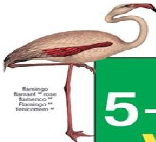
flamingo flamant " rose flamenco " " Flamingo " " fenicottero " "