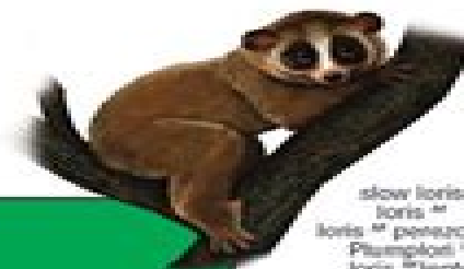
slow loris loris " " loris " perengos " " Plumpoti " " loris " lento " "