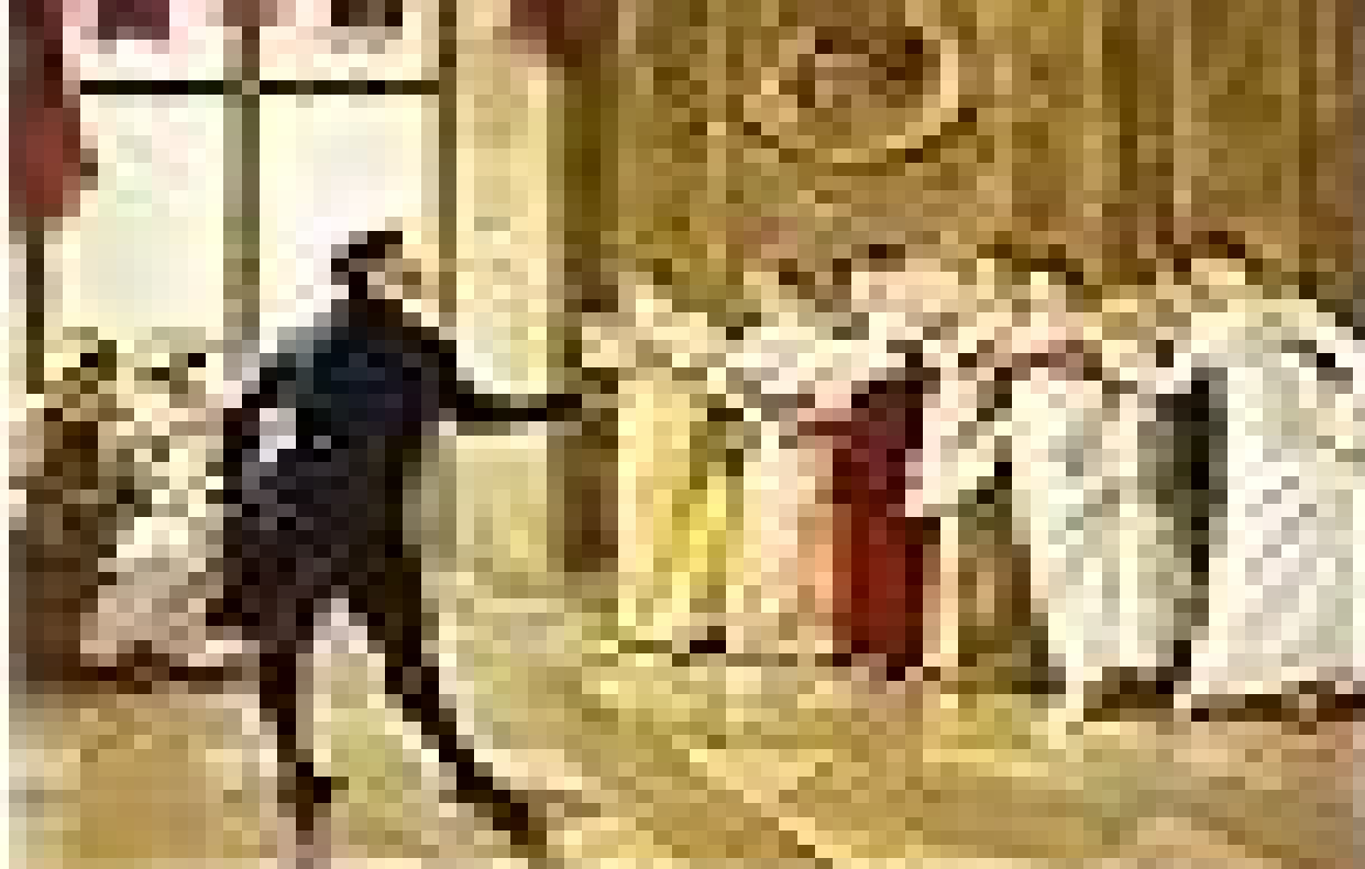
The Man in the Dark Suit and Hat