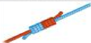
Double Uni Knot