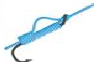
Egg Loop Knot