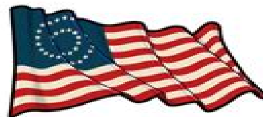
3) 37 Star Centennia Medallion Post Civil War 1867-1877