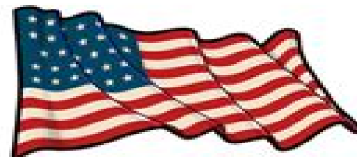
6) Union Flag (1861-1863)