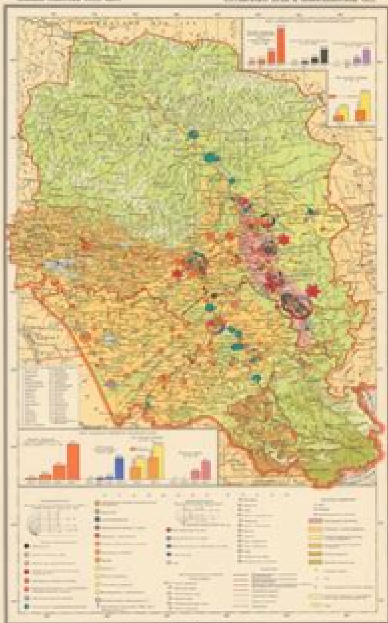
Figure 1.1. Geographical map of the Republic of Armenia showing the distribution of the population by region and district