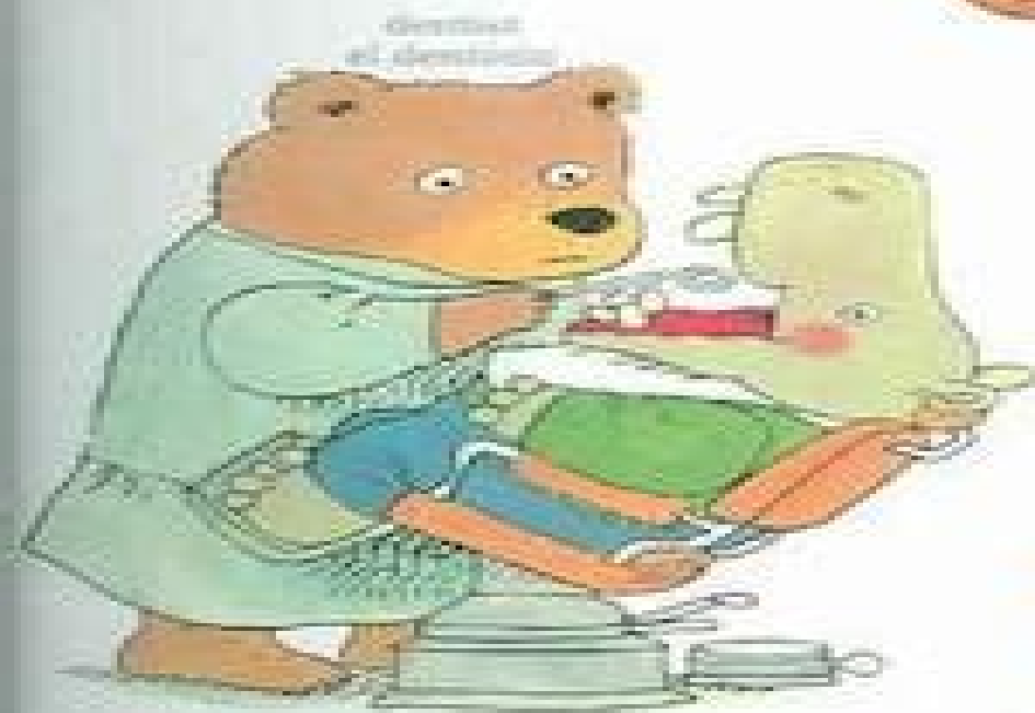
osito de osito