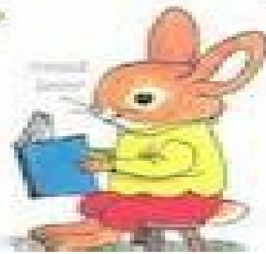
conejo de conejo