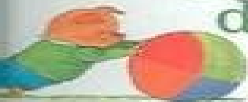
pelota de colores

El mejor libro de palabras de Richard Scarry