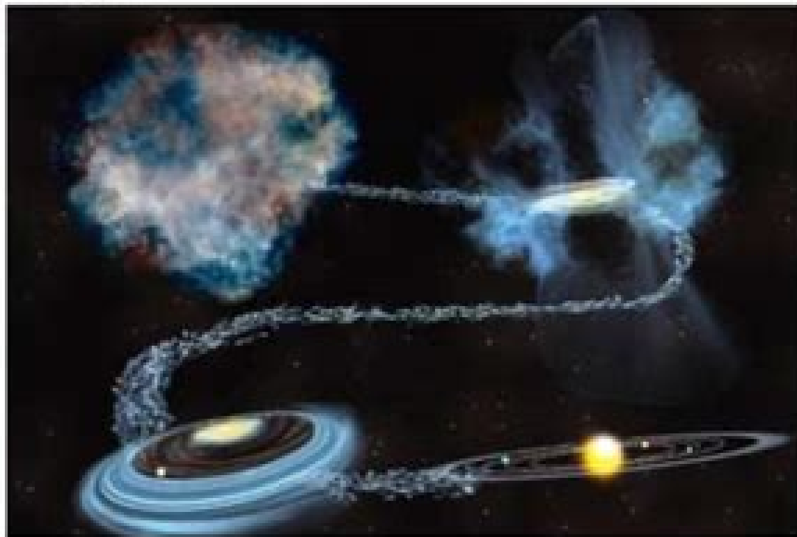
Формування Сонячної системи за небулярною гіпотезою Канта

Найпопулярнішою в сучасній астрономії є небулярна гіпотеза, запропонована 1775 р. видатним німецьким філософом Іммануїлом Кантом. Він припустив, що Сонячна система виникла з гігантської холодної пилової хмари. Її частки перебували в постійному безладному русі, взаємно притягуючи одна одну, зіткалися, злипалися, утворюючи згущення, які поступово зростали, ущільнювалися і згодом стали основами Сонця й планетам.