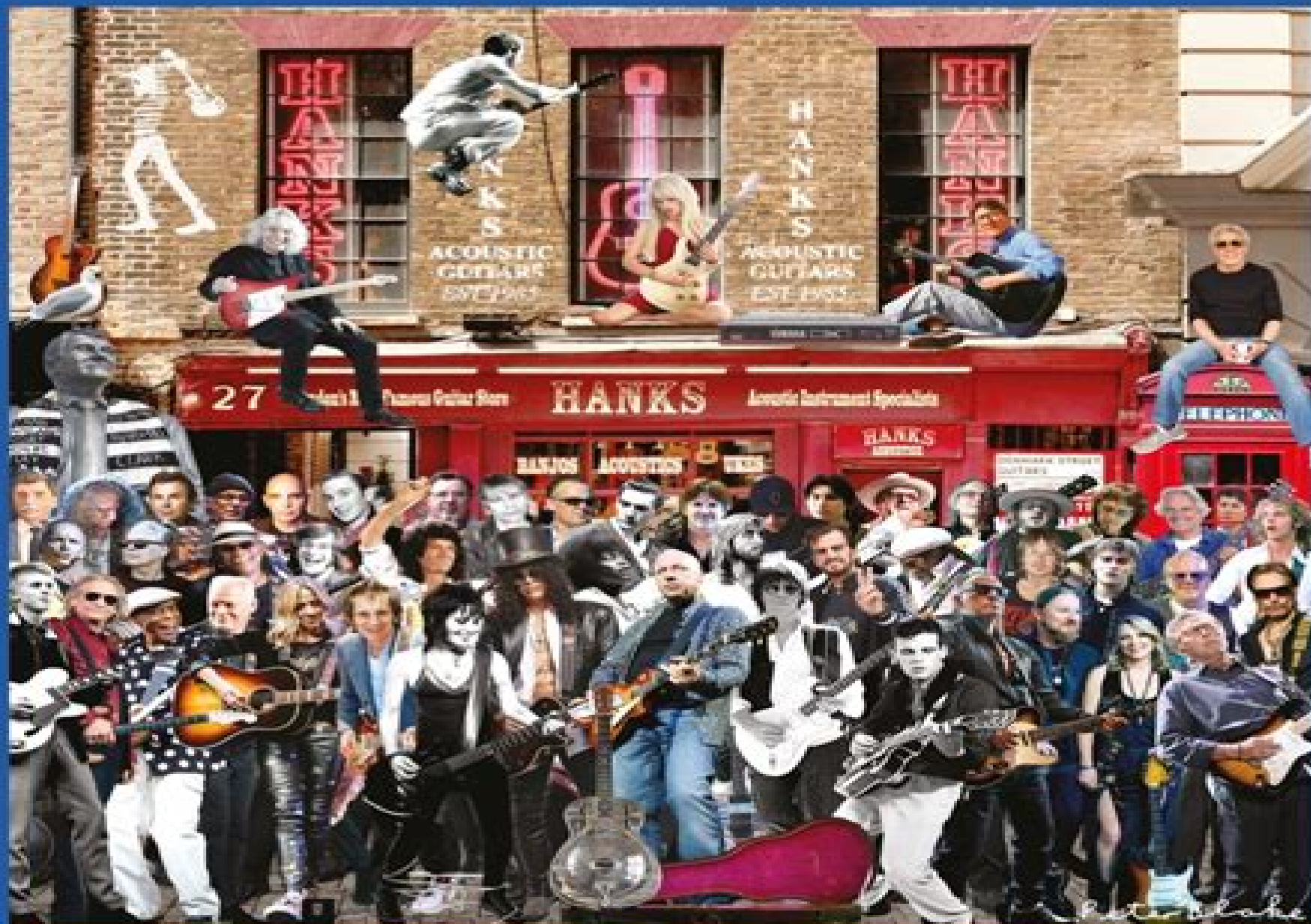
Mark Knopfler's Guitar Heroes - Going Home (Theme from Local Hero)