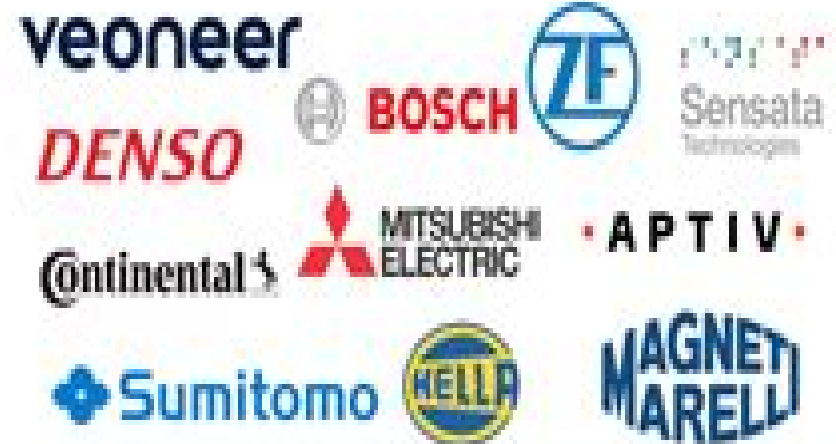
Notable Emerging Companies in Automotive ECU Market