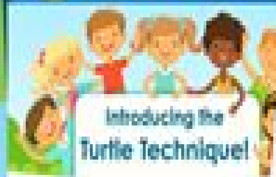
Introducing the Turtle Technique