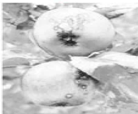
Парша на плодах яблони

Погодные условия 2008 г. были другими. Уже в первой декаде апреля среднесуточная температура воздуха устойчиво превышала 5 °С; в апреле, мае, июне и июле на фоне среднесуточной температуры воздуха 19,3–22,2 °С шли затяжные (более 5 дней) дожди; с мая по август отмечалось чередование экстремально жарких и аномально холодных периодов.