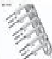
3 phase AC produced in a power station