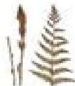
FERNS and CLUB MOSSES