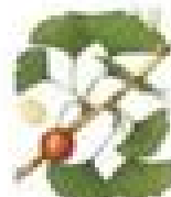
GINKGOS and GNETOPHYTES