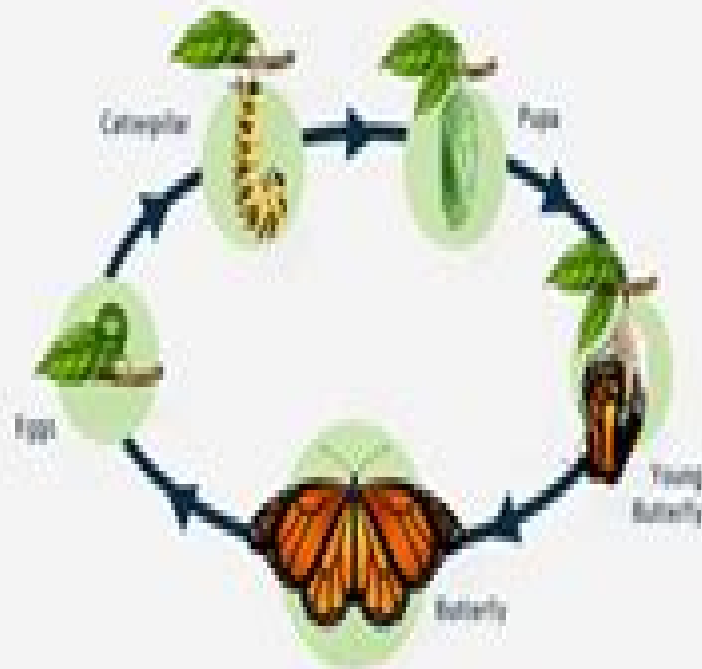
Butterfly Life Cycle

Holometabolous Life Cycle: Involves complete metamorphosis with distinct stages: egg, larva, pupa, and adult.