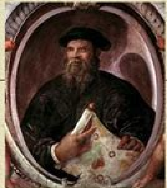
Magellan's Route: 1519-1522