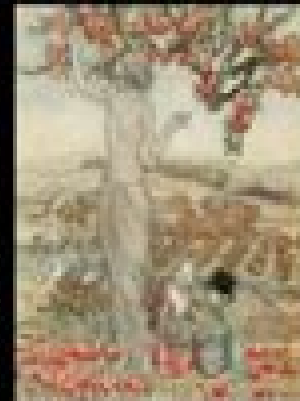
DEER OF APPLES