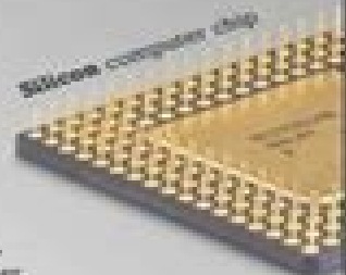
Silicon computer chip