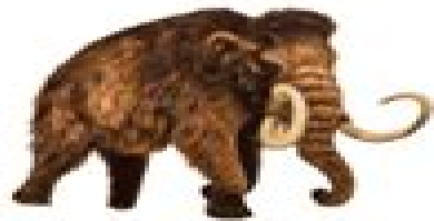
Woolly Mammoth ( Mammuthus primigenius )