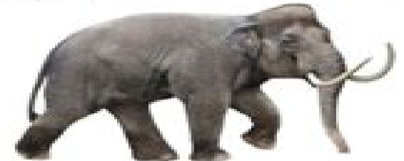
Cretan Dwarf Mammoth ( Mammuthus creticus )