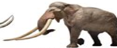
European Straight-tusked Elephant ( Palaeoloxodon antiquus )