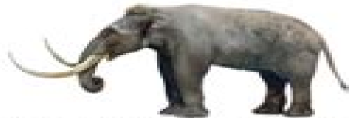
Channel Islands Mammoth ( Mammuthus exilis )