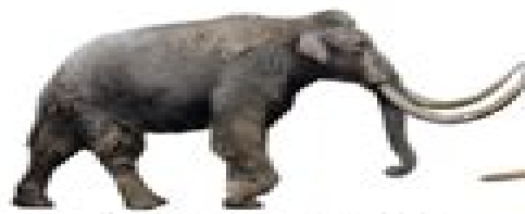
Steppe Mammoth ( Mammuthus trogontherii )