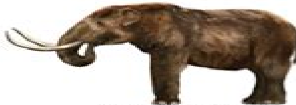
American Mastodon ( Mammut americanum )