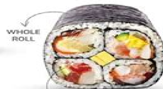
SEVEN DIFFERENT FILLINGS, EACH REPRESENTING ONE GOD OF FORTUNE