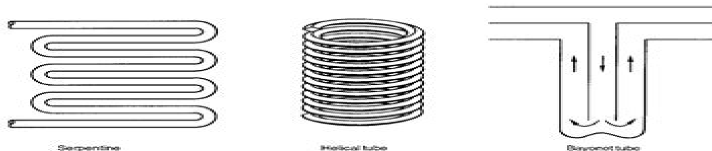
FIGURE 1.8 Additional tube configurations used in shell-and-tube exchangers.