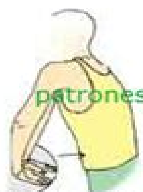
Flexión del tramo de muñeca