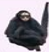
White-Cheeked Spider Monkey