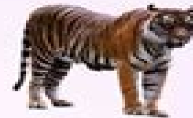
Sunda Island Tiger