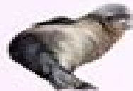
Hawaiian Monk Seal