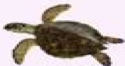
Hawksbill Sea Turtle