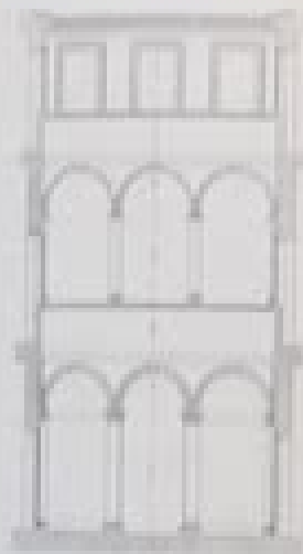
Fig. 1. Tower section.