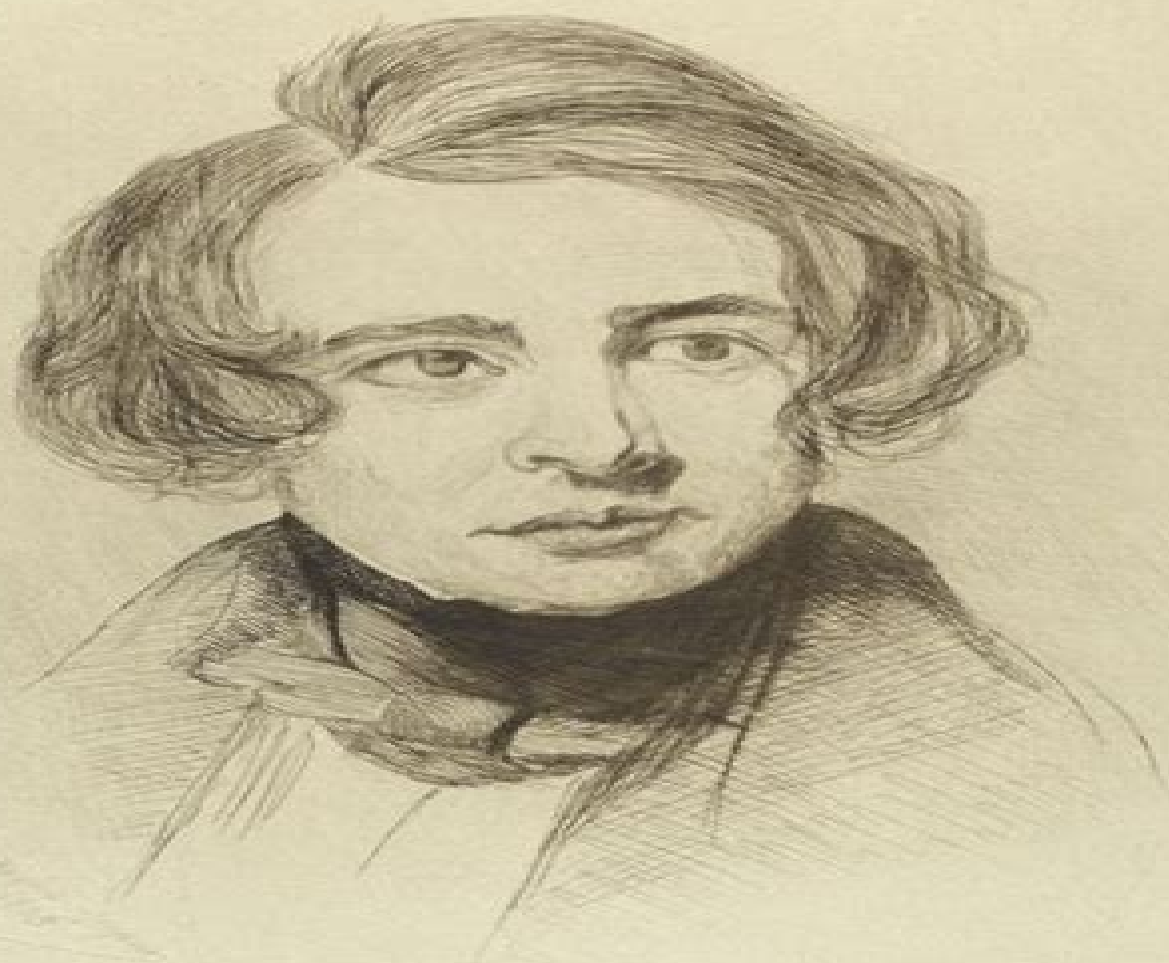
CHARLES DICKENS à 18 ans. (Dessin d'un anonyme.)