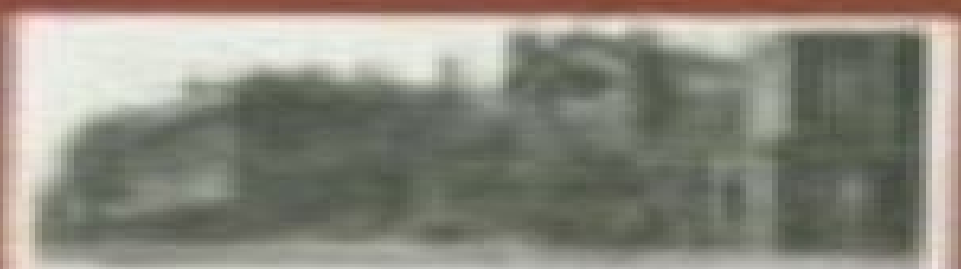
Edinburgh City Council, Edinburgh City Council, Edinburgh City Council