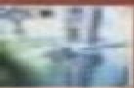
Edinburgh City Council, Edinburgh City Council, Edinburgh City Council