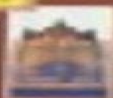
Edinburgh City Council, Edinburgh City Council, Edinburgh City Council