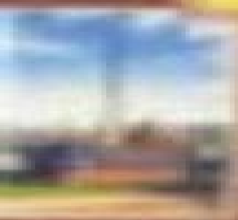
Edinburgh City Council, Edinburgh City Council, Edinburgh City Council