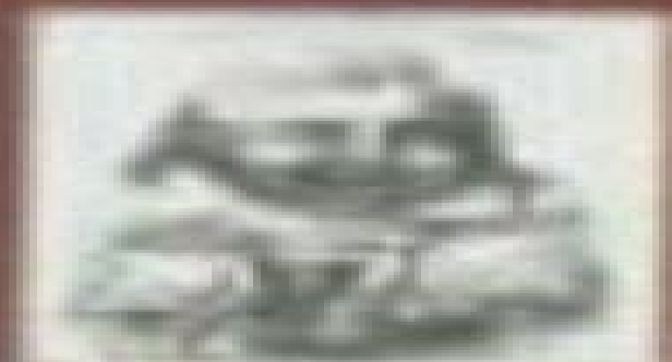
Edinburgh City Council, Edinburgh City Council, Edinburgh City Council