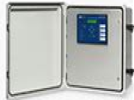
Capacitor Bank Controller