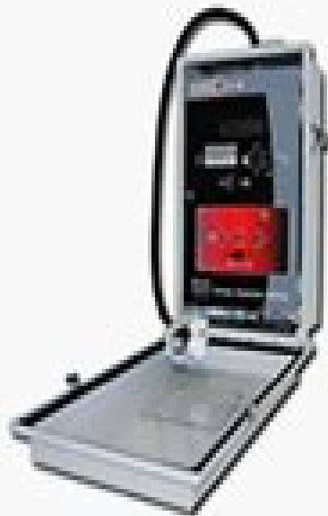
Voltage Regulator Controller