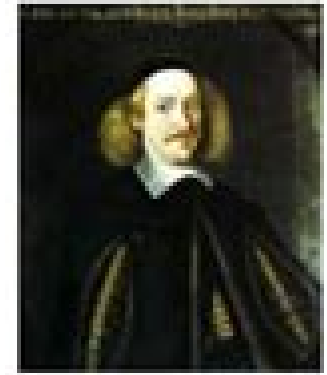
Otto von Guericke