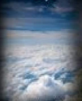
Atmosphere and sky