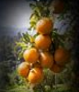
Dry land, plants and fruit trees