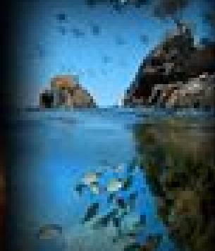
Birds, and sea creatures