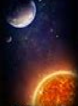
Sun, moon, and stars