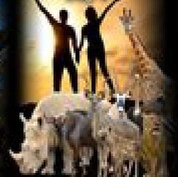
Land animals, Adam and Eve