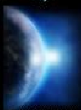
Earth covered by water, light